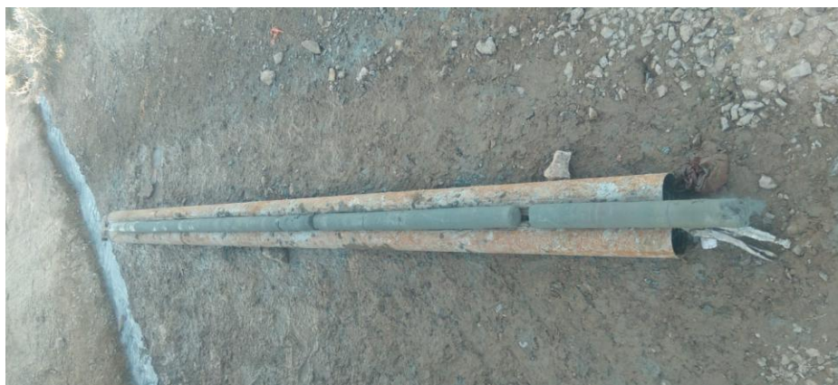
Image 1 – a portion of the over 297ft of lithium-hosted clays from CVZ-61. Greenish-blue clays typically indicating higher levels of lithium.

Vancouver, British Columbia – November 17, 2020 – Noram Ventures Inc. (“Noram”) (TSX - Venture: NRM / Frankfurt: N7R / OTCQB: NRVTF) is pleased to announce the completion of Hole #1 (CVZ-61) at a depth of approximately 417ft (127m) and with an intersection of approximately 297ft (91m). CVZ-61 was drilled on the southeast side of the northeast-trending fault in a previously unexplored area. At this point it is unclear whether the SE side of the fault has been raised or lowered in relation to the NW side. “Noram specifically designed this program to sizably expand the area of exploration and better delineate the resource area. The Company will use these data for feasibility studies in the near future,” stated President and CEO, Dr. C. Tucker Barrie.